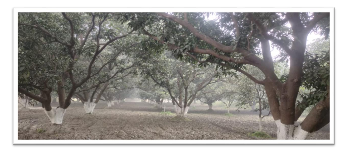
Mother Plant Mango Nursery