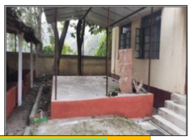
Thresing floor & Mushroom preparation Floor