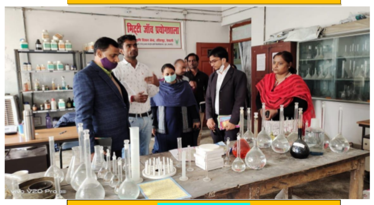
Soi Testing Laboratory