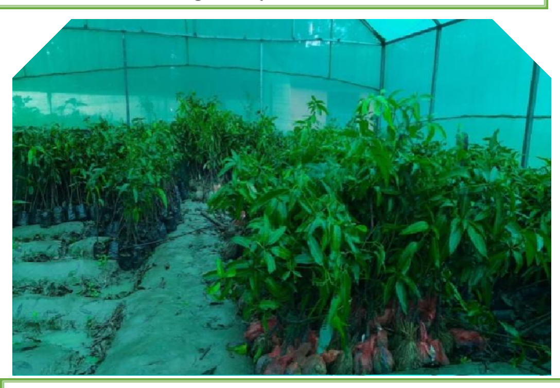
Planting material produced