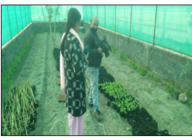
Production in Shade Net House