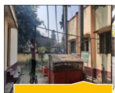
Zero energy cool chamber