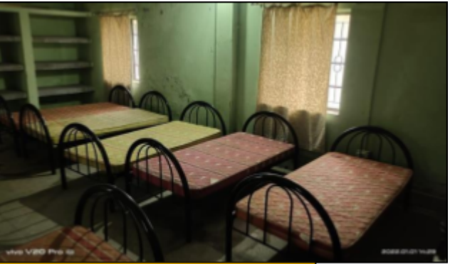
Accomodation facilities in Kisan Ghar